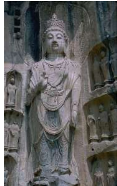
1.3.2.1 Avalokiteśvara (masculine form, 13.3 cm = 43 ft 7 in high), Longmen 龍門, China

The name Guānyīn 觀音, freely translated, means “the one who heeds calls,” that is, anyone at all who seeks succour or solace in Guān-