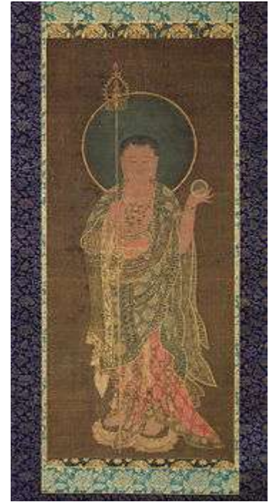
1.3.3 Kṣīti,garbha scroll, Koryo (Korean), late 14 th cent

1.3.3.2 DÌZÀNG’S ORIGIN AND APPEARANCE. Dìzàng’s depiction as a monk is traditionally said to be on account of Kim Kiaokak (Kor: Kim Gio Gak, Jīn Qiáojié 金喬覺), a prince of Silla (the southernmost