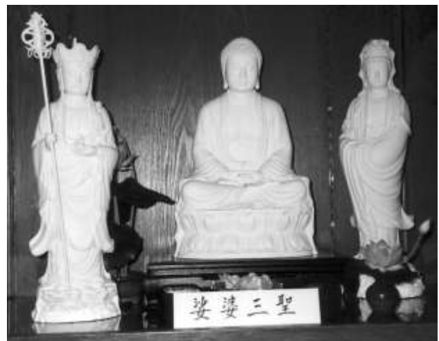
1.3.1 The Sahā Triad ( suōpó sānshèng 娑婆三聖): Shakyamuni Buddha flanked by Dizàng (l) and Guānyīn (r). (Buddhist merchandise store, Yungang, in the Hong Lim Complex, South Bridge Road, Singapore.)

One of the most enduring influences of Buddhism on Chinese society was through the production of cosmic or transcendental bodhisattvas, especially Guānyīn 觀音 and Dizàng 地藏 (Kṣīti, garbha). So popular are these two bodhisattvas that they, along with the historical Buddha, in the recent decades, formed their own trinity called “ the Sahā Triad ” ( suōpó sānshèng 娑婆三聖) [fig 1.3.1]. 41 The Sahā Triad