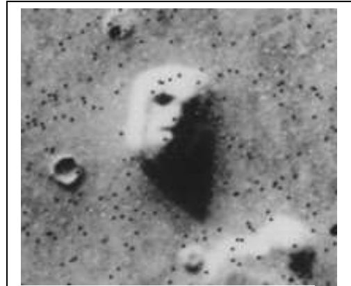
A satellite photo of a mesa in Cydonia , often called the Face on Mars . Later imagery from other angles did not show the illusion. ( Wikipedia )

there is nothing inherently external or intersubjective about external space, nor is there anything inherently internal or private about internal space. While we commonly speak of directing the attention outward to the physical world or inward to the mind, this distinction is only conventional. Our experience presents us with only the nondual space of consciousness, in which the distinctions between outer and inner are artificially superimposed by concepts and language. 111