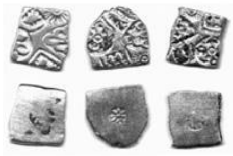
Fig 1.1 Early punch-marked coins from Bengal